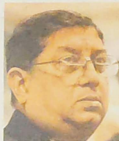
WASNT ME: (Left) Part of the text message that IPL team owners supposedly received from N Srinivasan's number yesterday