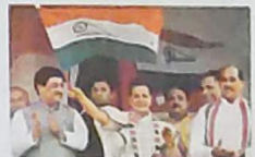
UNITED FRONT: Sonia Gandhi with Ashok Chavan & Manikrao Thakre at the rally

The 'zhenda march' at Sewagram was meant to enhance the image of Congress president Sonia Gandhi, but the 'funding' controversy surrounding the event left it sullied. The All India Congress Committee (AICC) has not taken kindly to it.