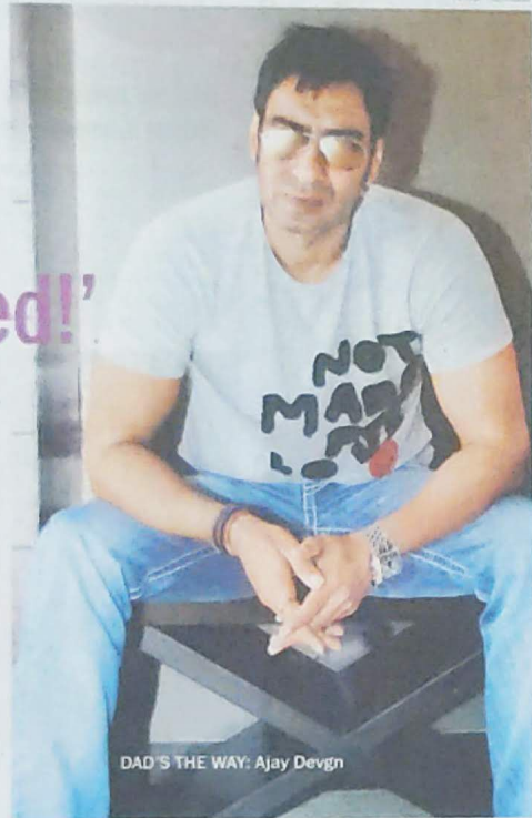
DAD'S THE WAY: Ajay Devgn

Whenever a baby is born, everybody rushes to find out whose features the baby has. "Oh! It's too early to figure out about his features. He is just too small," gestures Ajay with his palms, admitting that this time around the parents are not finding it very difficult to handle a new-born. "It doesn't seem so hard this time around because we have gone through the whole routine once. But the feeling (of having a child again) is something that only a parent can understand, and cannot be put into words," he adds.